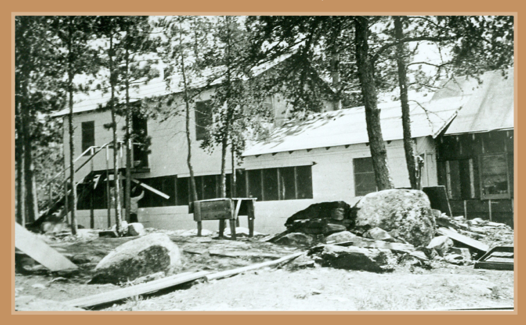
CAMP MARSTON DINING HALL, 1927