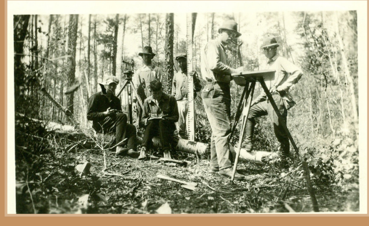
TOPOGRAPHY PARTY, 1924