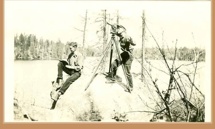
TOPOGRAPHICAL WORK, 1924